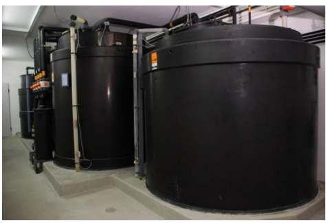
Neutra chemical storage tanks