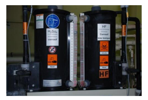
CSS, Automatic chemical consumption monitoring