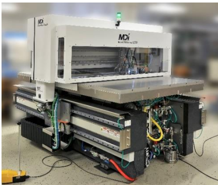
Thin glass cutter TGC

MDI Advanced Processing GmbH Obere Austrasse 6 55120 Mainz Germany Phone: +49 (0) 61 31 / 73 21-0 Fax: +49 (0) 61 31 / 73 21-101 E-mail: sales@mdi-ap.com www.mdi-ap.com